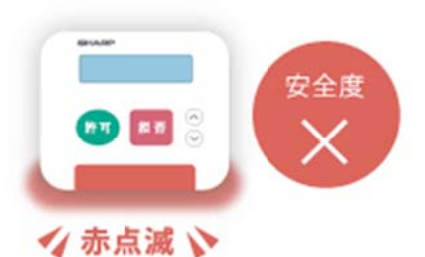
Flashing red light

When a call is received from a payphone, or a number that is not on the nuisance caller number list, the LED flashes yellow, indicating that the safety of the call is unknown.